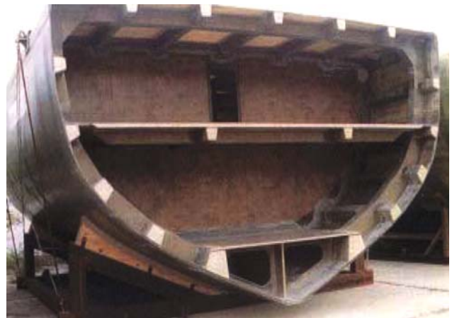
Figure 4. SCRIMP Technology Demonstrators Funded by NSWCCD, Clockwise from top left: Advanced Composite technology Deckhouse (1988); Advanced Material Transporter (1991); Helicopter Hanger Door (2000) and Half-Scale Corvette Hull (tested 2003)