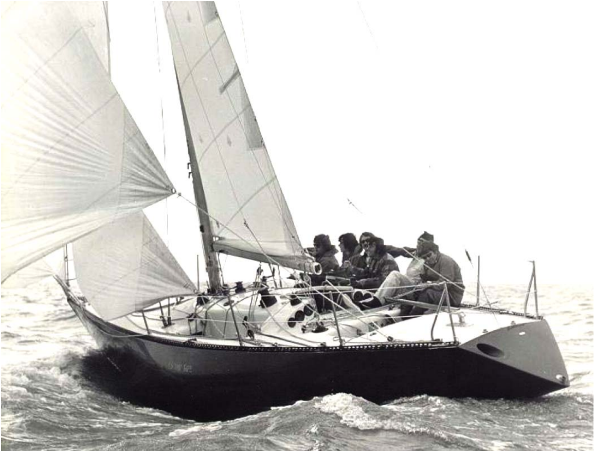
Figure 3. SWAMP FIRE , First Place, \frac{3}{4} Ton World Championship 1974