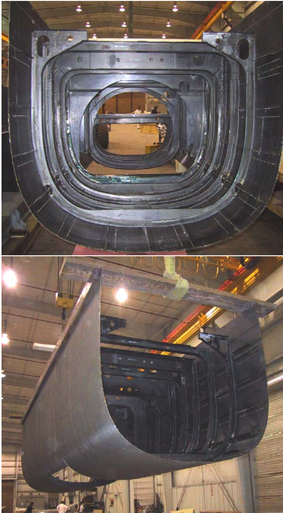
Figure 6. Prototype Apache Helicopter Fuselage for Boeing Corporation