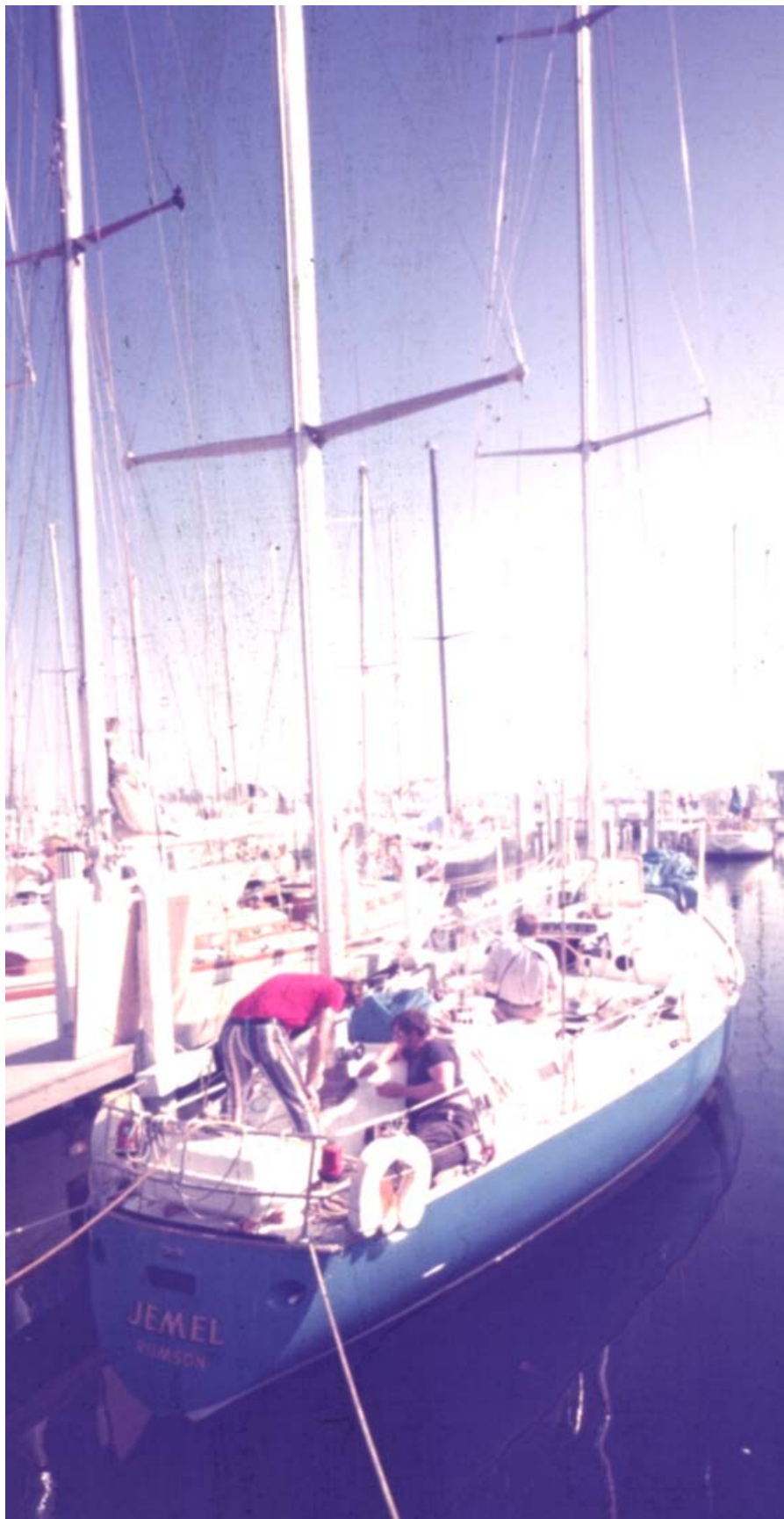
Figure 1. New Orleans Marine First Boat, 44-Foot Brit Chance-Designed JEMEL in St Petersburg, FL for the SORC