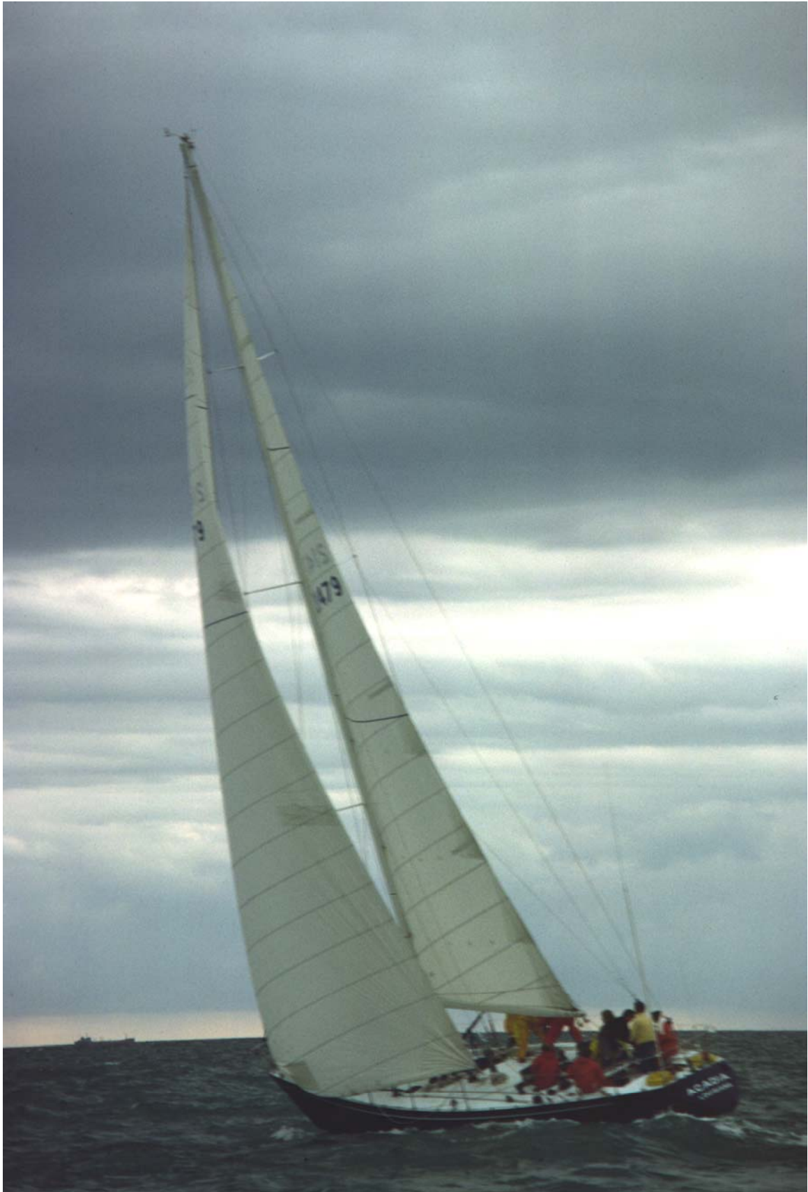
Figure 2. Burt Keenan's ACADIA, 1978 SORC Winner