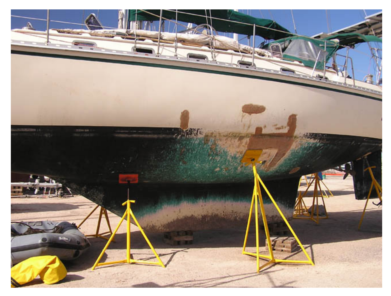
Figure 1. Visual Inspection of Hull Damage from Grounding Showing Temporary Repair