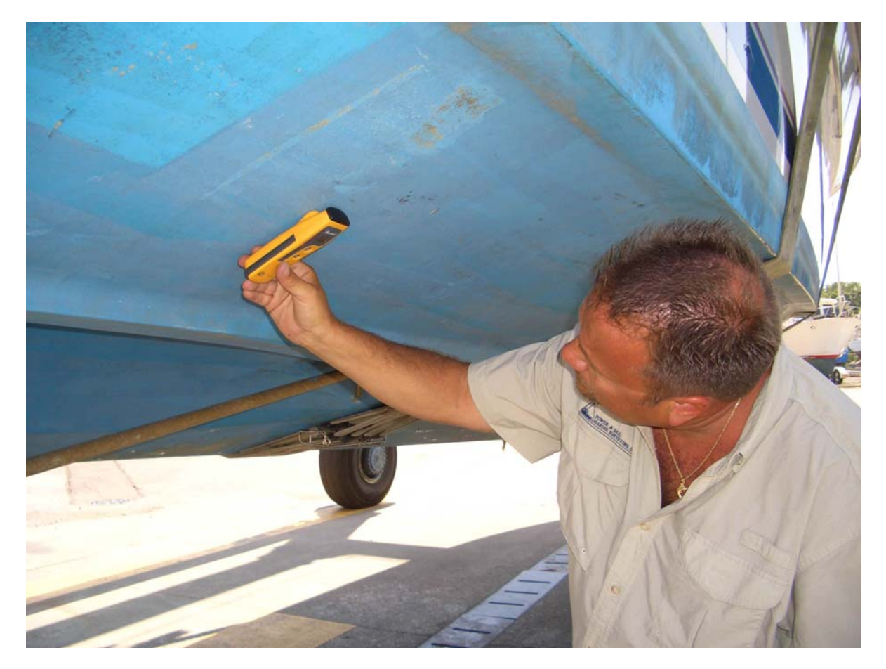
Figure 2. A Marine Surveyor Uses a Moisture Meter to Examine a Boat Bottom